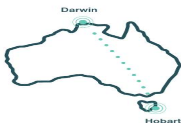
1.8 million mattresses discarded and placed end-to-end stretches from the bottom to the top of Australia.

Every year in Australia, approximately 1.8 million mattresses are disposed of. Placed end-to-end, they would stretch from the bottom to the very top of the continent. Around 40% end up directly in landfill or illegally dumped. Of the 60% presented for recycling, an estimated 64% of material can still end up in landfill – leaving significant room to improve recovery and divert more material from waste streams.