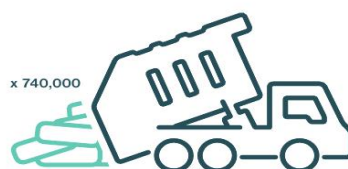
About 40% of mattresses end up in landfill or dumped, while 60% are presented for some form of recycling, e.g. deconstruction or shredding.