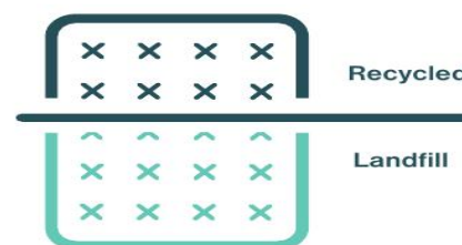
As much as 64% of materials from recycling processes may still end up in landfill.